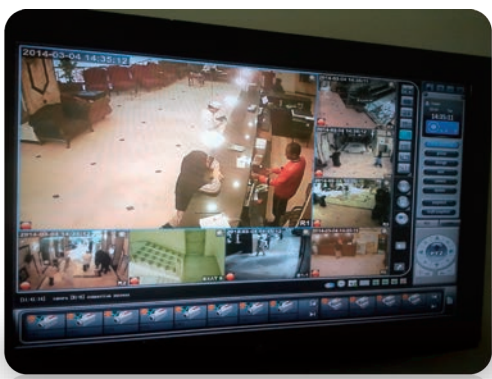
GKB Envoy™ NVR-10

Hotel Al Fayroz Season is located in central area in Medina, Saudi Arabia, where the Prophet’s Mosque is within a short walking distance. The hotel provides 506 rooms and suits, and accommodates more than 1500 guests. To have better protection of guests’ safety and optimize hotel quality, the management team proposed a need for reliable and flexible surveillance system. GKB professional IP solution, including Diplomat IP cameras and our most featured Cloud Platform secures Hotel Al Fayroz Season with an additional layer of security.