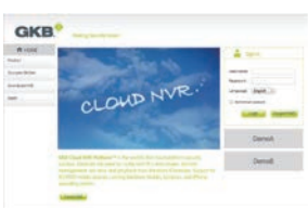
GKB Cloud NVR Platform